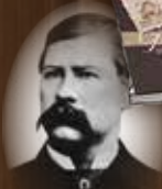
Virgil Walter Earp July 18, 1843 – October 19, 1905 U.S. and City Marshal for Tombstone, Arizona King Solomon Territorial Masonic Lodge No. 5