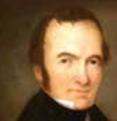
Stephen Fuller Austin November 3, 1793 – December 27, 1836 "The Father of Texas", sought to establish Freemasonry in Texas, and founder of the Texas Rangers Louisiana Masonic Lodge No. 111, Ste. Genevieve, Missouri