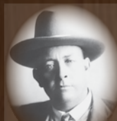
Francis Augustus Hamer March 17, 1884 – July 10, 1955 Texas Ranger Captain who led posse to track and kill Bonnie Parker and Clyde Barrow Navasota Masonic Lodge No. 299, Navasota, Texas