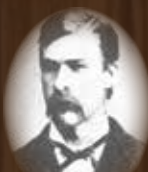
Morgan Seth Earp April 24, 1851 – March 18, 1882 Served as Special Policeman for Tombstone, Arizona King Solomon Territorial Masonic Lodge No. 5