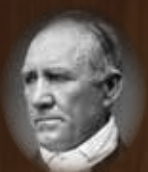
Samuel Houston March 2, 1793 – July 26, 1863 American General, Statesman, and supporter of the Texas Rangers Cumberland Masonic Lodge No. 8, Nashville, Tennessee Holland Masonic Lodge No. 36, Brazoria, Texas