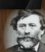
Count Agoston Haraszthy August 30, 1814 – July 6, 1869 Adventurer, pioneer winemaker, first elected Sheriff of San Diego County, served as city Marshal, and built jail for the city San Diego Masonic Lodge No. 35, San Diego, California