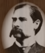
Wyatt Berry Stapp Earp March 19, 1848 – January 13, 1929 Lawman for Dodge City, Deadwood, and Tombstone King Solomon Territorial Masonic Lodge No. 5