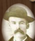
John Henry "Doc" Holliday August 14, 1851 – November 8, 1887 Dentist, gambler, and gunfighter at Tombstone's OK Corral Atlanta Masonic Lodge No. 59, Atlanta, Georgia